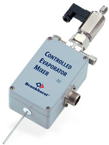
CEM EVAPORATOR W-101A

Max. 2 g/h liquid; Max. 4 l/min gas Pressure rating 100 bar Very stable vapour flow Flexible gas/liquid ratio