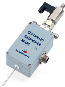
CEM EVAPORATOR W-202A

Max. 2 g/h liquid; Max. 4 l/min gas Pressure rating 100 bar Very stable vapour flow Flexible gas/liquid ratio