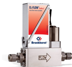
EL-FLOW SELECT F-201AV

최저 유량 범위 0,4...20 ln/min 최대 유량 범위 0,6...100 ln/min 압력 범위 64 bar 컴팩트 디자인 높은 정확도 & 재연성