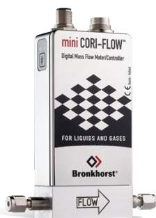
MINI CORI-FLOW™ MXX

Flowbereik 0...300 l/u Druk tot 200 bar Hoge nauwkeurigheid, snelle respons Dichtheid en temperatuur output