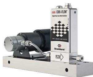
MINI CORI-FLOW™ CORIOLIS WITH PUMP

Vloeistof-regelventielen Directgestuurde ventielen Druk tot 64/100 bar Kv-max: 6,6 \times 10^{-2}