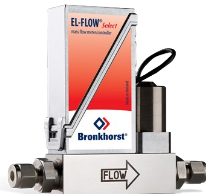
EL-FLOW SELECT F-201CV

Min. druk 5...100 mbar Max. druk 3,2...64 bar Absolute druk of overdruk Hoge nauwkeurigheid