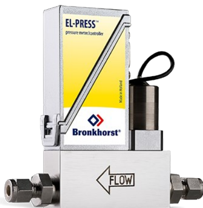
EL-PRESS P-602CV (P2-CONTROL)

Min. flow 0,8...40 l/min Max. flow 5...250 l/min Pressure rating 64 bar Compact IP65 design High accuracy and repeatability