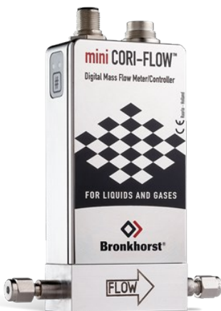
MINI CORI-FLOW™ M14

Min. flow 0,03...1 kg/h Max. flow 0,3...30 kg/h Drukklass 200 bar Onafhankelijk van vloeistofeigenschappen Hoge nauwkeurigheid