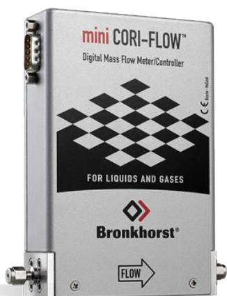
MINI CORI-FLOW™ ML120V00

Flowbereik 0...200 g/h Drukklasse 200 bar Onafhankelijk van vloeistofeigenschappen Hoge nauwkeurigheid