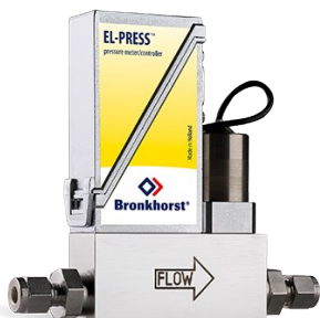
EL-PRESS P-702CV (P1-CONTROL)

Min. flow 1...50 l n /min Max. flow 10...500 l n /min Drukklasse tot 20 bar Robuuste sensor en behuizing (IP65) Optioneel geïntegreerd TFT display