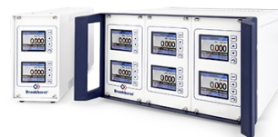
E-8000 SERIES DIGITAL READOUT / CONTROL SYSTEMS

Min. flow 0,16...8 ml n /min Max. flow 0,5...25 l n /min Drukklasse 64 bar Compact design Hoge nauwkeurigheid en herhaalbaarheid