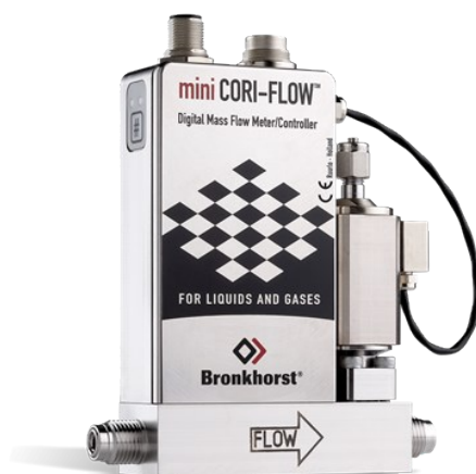
MINI CORI-FLOW™ M13V14I

Min. flow 0,1...5 g/h Max. flow 2...200 g/h Drukklasse 100 bar Vloeistof onafhankelijk Hoge nauwkeurigheid, snelle regeling