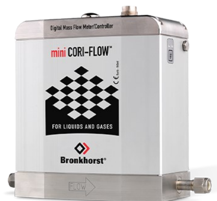
MINI CORI-FLOW™ M15

Min. flow 1...50 g/h Max. flow 20...2000 g/h Drukklasse 100 bar Vloeistof onafhankelijk Hoge nauwkeurigheid, snelle regeling