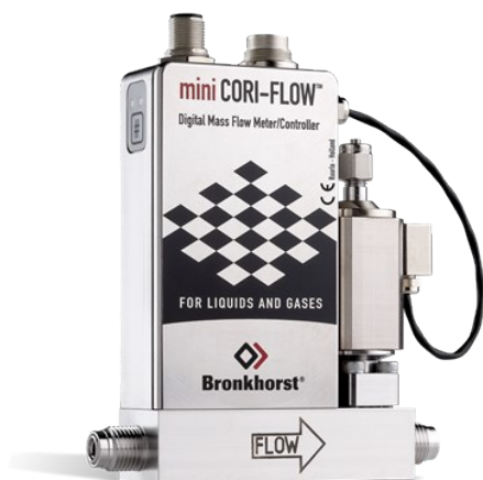
MINI CORI-FLOW™ M14V14I

Min. flow 0,03...1 kg/h Max. flow 0,3...30 kg/h Drukklasse 100 bar Vloeistof onafhankelijk Hoge nauwkeurigheid, snelle regeling