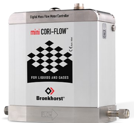
MINI CORI-FLOW™ M15

Min. flow 0,03...1 kg/h Max. flow 0,3...30 kg/h Drukklasse 100 bar Vloeistof onafhankelijk Hoge nauwkeurigheid, snelle regeling