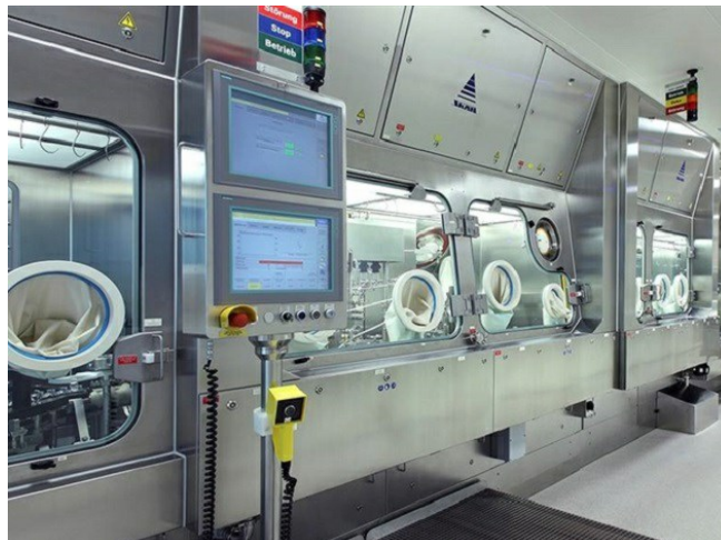
Isolator of SKAN AG, global player in the field of cleanrooms and isolators for the pharmaceutical industry

The Swiss based company SKAN AG , a global player in the field of cleanrooms and isolators for the pharmaceutical industry, asked Bronkhorst to help them with calibrating the air flow of the different microbial air sampler types that are required from the process owner.