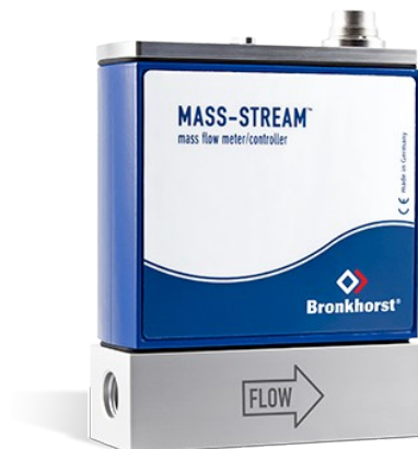
MASS-STREAM D-6340 MFM

Min. Bereich 0,03...1 kg/h Max. Bereich 0,3...30 kg/h Druckstufe 200 bar Medienunabhängig Hohe Genauigkeit, schnelle Messung