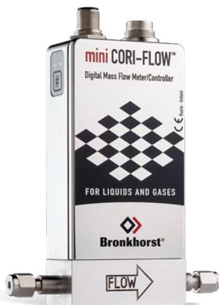
MINI CORI-FLOW™ M14

Min. Bereich 0,03...1 kg/h Max. Bereich 0,3...30 kg/h Druckstufe 200 bar Medienunabhängig Hohe Genauigkeit, schnelle Messung