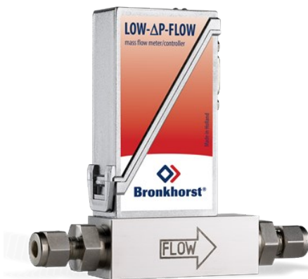
LOW- \Delta P-FLOW F-101D

Min. flow 0,42...21 mln/min Max. flow 0,042...2,1 ln/min Druk tot 10 bar Zeer lage drukval Geschikt voor corrosieve gassen