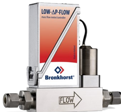
LOW- \Delta P-FLOW F-201EV

Min. flow 0,42...21 mln/min Max. flow 0,042...2,1 ln/min Druk tot 10 bar Zeer lage drukval Geschikt voor corrosieve gassen