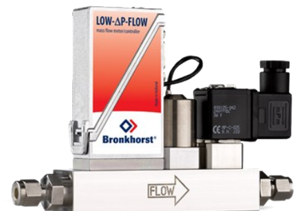
LOW- \Delta P-FLOW F-201ES

Min. flow 0,028...1,4 ln/min Max. flow 0,24...12 ln/min Druk tot 10 bar Lage \Delta P, gemakkelijk te spoelen Compact ontwerp