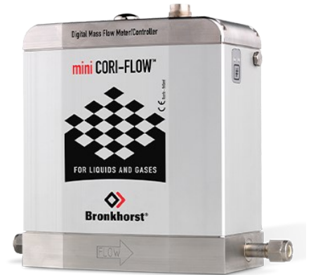
MINI CORI-FLOW™ M15

Min. flow 0,05...5 g/h Max. flow 2...200 g/h Drukklass 200 bar Onafhankelijk van vloeistofeigenschappen Hoge nauwkeurigheid