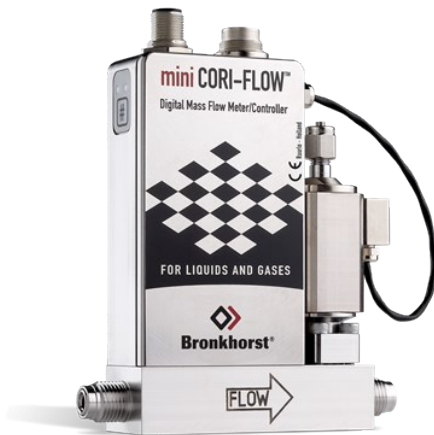
MINI CORI-FLOW™ M13V14I

Min. flow 1...50 g/h Max. flow 20...2000 g/h Drukklass 100 bar Vloeistof onafhankelijk Hoge nauwkeurigheid, snelle regeling