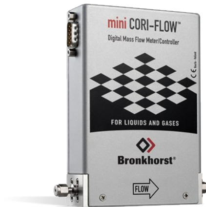
MINI CORI-FLOW™ ML120V00

Min. flow 1...50 g/h Max. flow 20...2000 g/h Drukklass 100 bar Vloeistof onafhankelijk Hoge nauwkeurigheid, snelle regeling