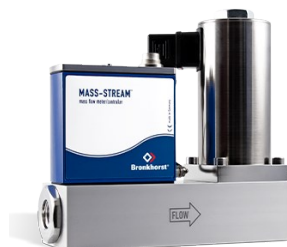
MASS-STREAM D-6371/004BI MFC