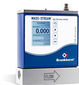
MASS-STREAM D-6310 MFM