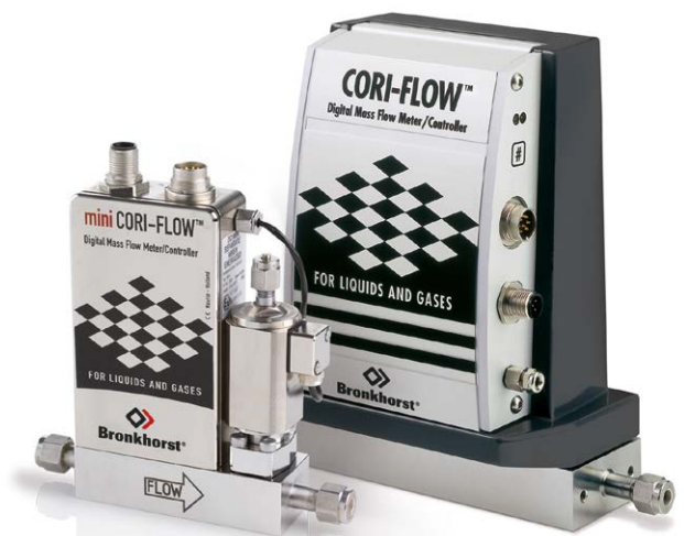
Coriolis Mass Flow instruments

Bronkhorst low flow Coriolis instruments are also used for foam extrusion (supercritical CO 2 dosing), synthesis of monomers and dosing release agents in molds.