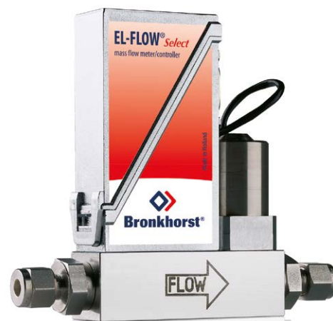
Digital Mass Flow Controller for gases, model F-201CV

In the plastics and rubber industry, Electronic Pressure Controllers are frequently used in plastic extrusion and/or molding processes, e.g. for the production of lightweight but rigid (hollow) profiles, car parts or plastic crates and boxes.