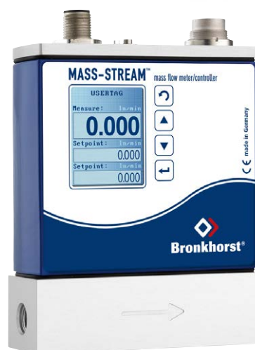
Gas flow meter/controller series D-6300 with integrated display and push buttons for local operation