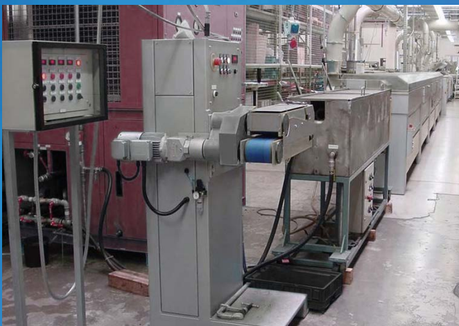
Machine for hollow plastic profile production