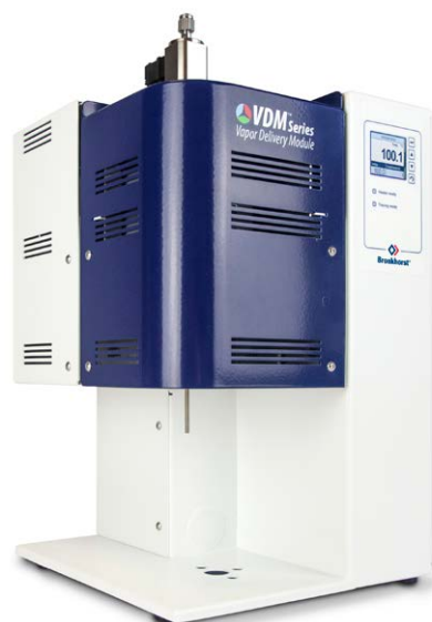
Vapor Delivery Module (VDM)