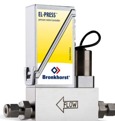
EL-PRESS series Forward Pressure Controller