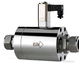
SERIE F-002A, F-003A, F-003B

Flow up to approx. 100 ln/min Pressure up to 400/700 bar For high (differential) pressures applications