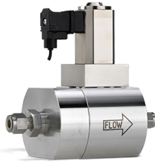
SERIES F-033, F-042

Flow up to approx. 50 ln/min Pressure up to 64/100/200 bar Kv-max: 6.6 \times 10^{-2}