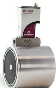
IN-FLOW 'HIGH-FLOW' F-106FI

Min. flow 14 ... 700 m3n/h Max. flow 140 ... 7000 m3n/h Pressure rating up to 40 bar Wafer type connection (DIN/ANSI) Rugged IP65 housing